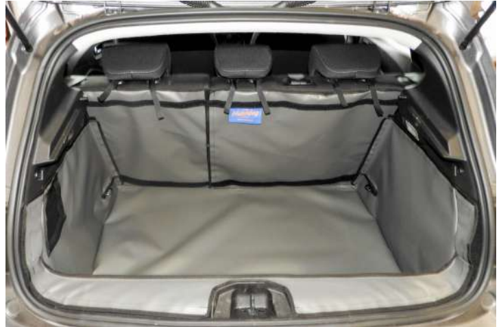
Rear Plus with Seat Split boot liner prepped for a seat flap, boot liner extension and bumper flap.