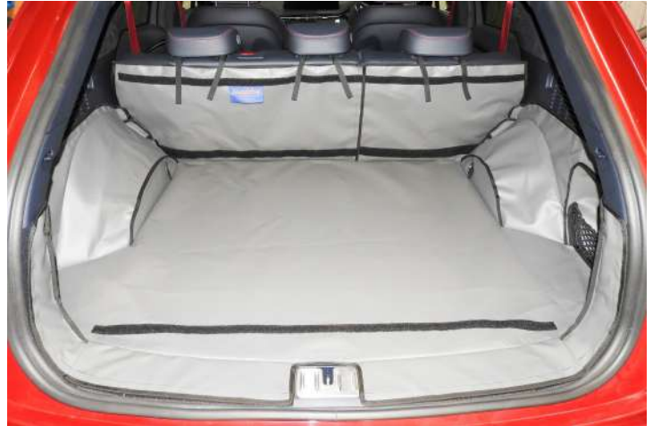
Rear Plus with Seat Split boot liner prepped for a seat flap, boot liner extension and bumper flap.