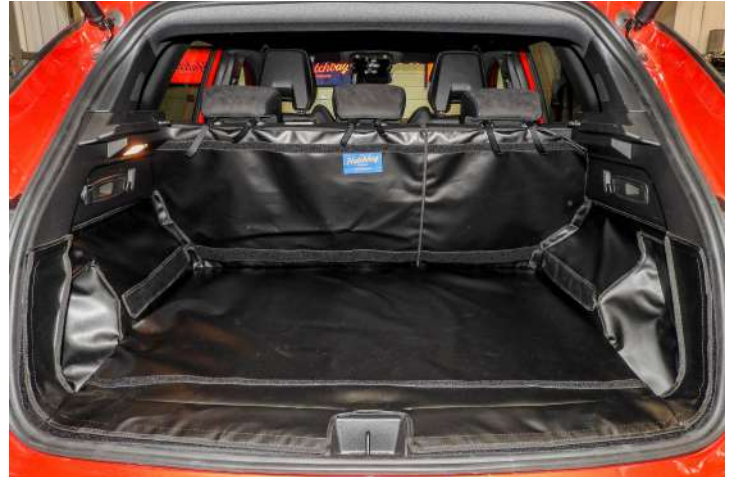
Rear Plus with Seat Split boot liner prepped for a seat flap, boot liner extension and bumper flap.