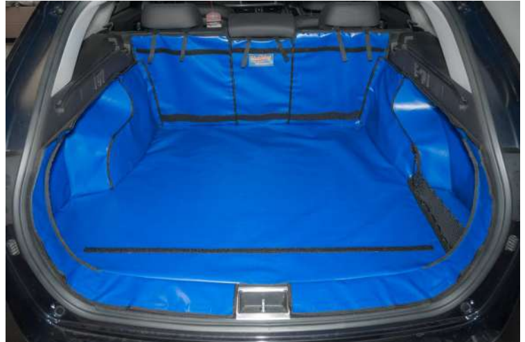
Rear split boot liner prepped for a seat flap, bumper flap & boot liner extension NET - With storage net on boot side