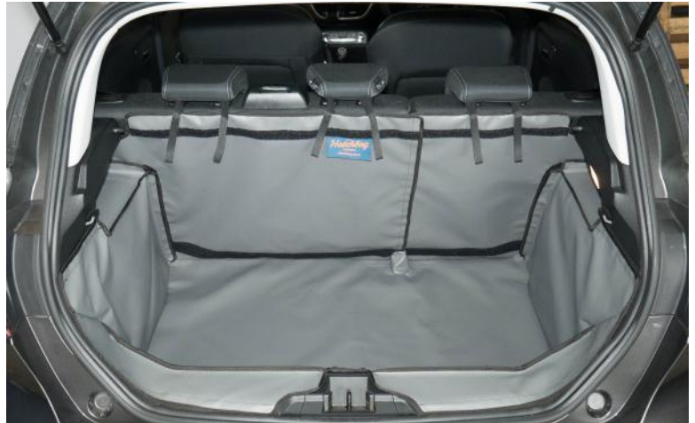
Rear split, prepared for bumper flap and floor extension