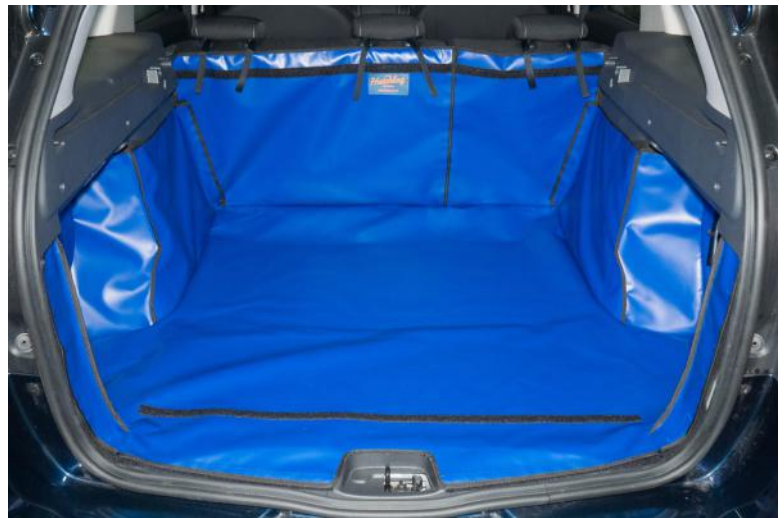
Rear split, prepared for bumper flap & seat flap