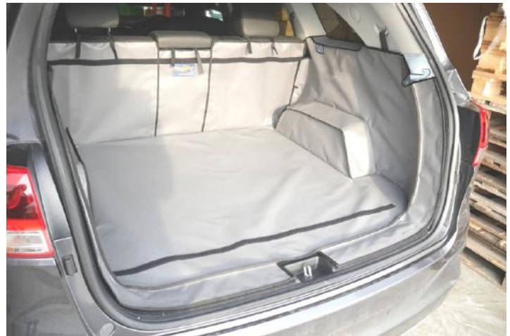
Load cover out version - Rear plus with seat split boot liner Inc. seat & bumper flap preparation