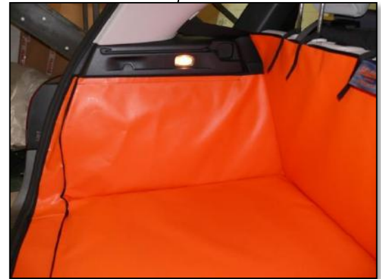
Floor raised version