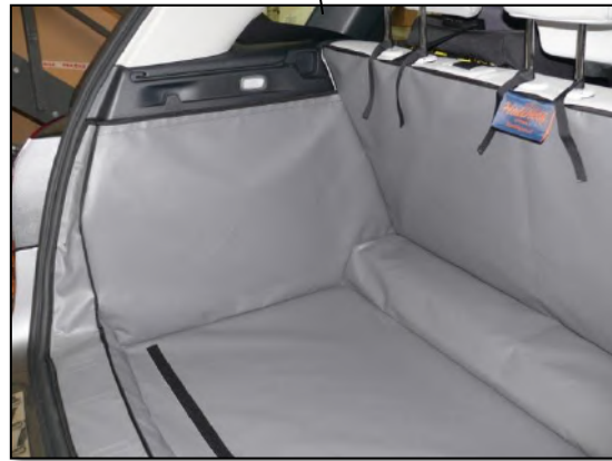
Floor Low version